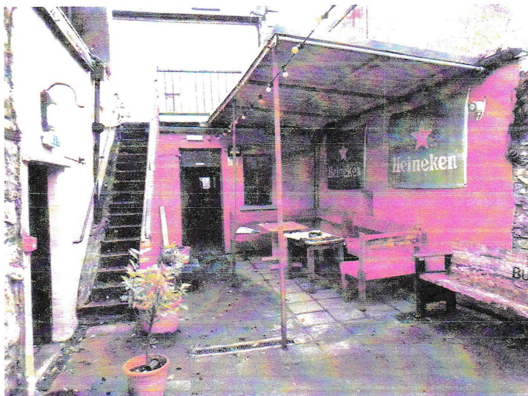
View of former rear Beergarden cum Smoking Patio.