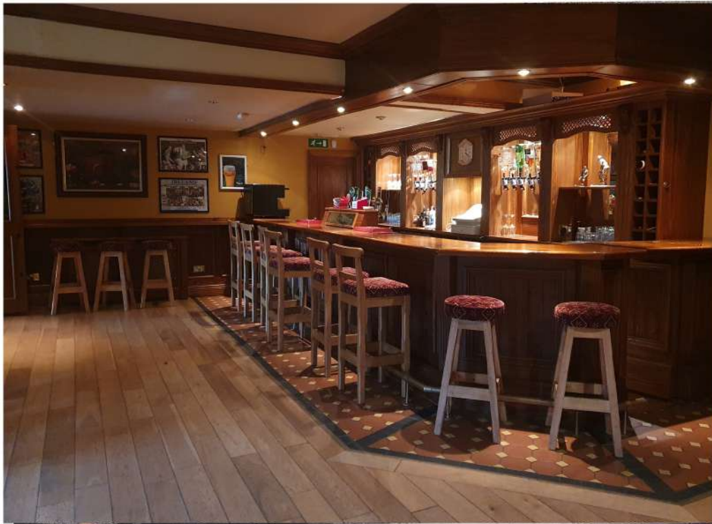
View of Lounge Bar counter area