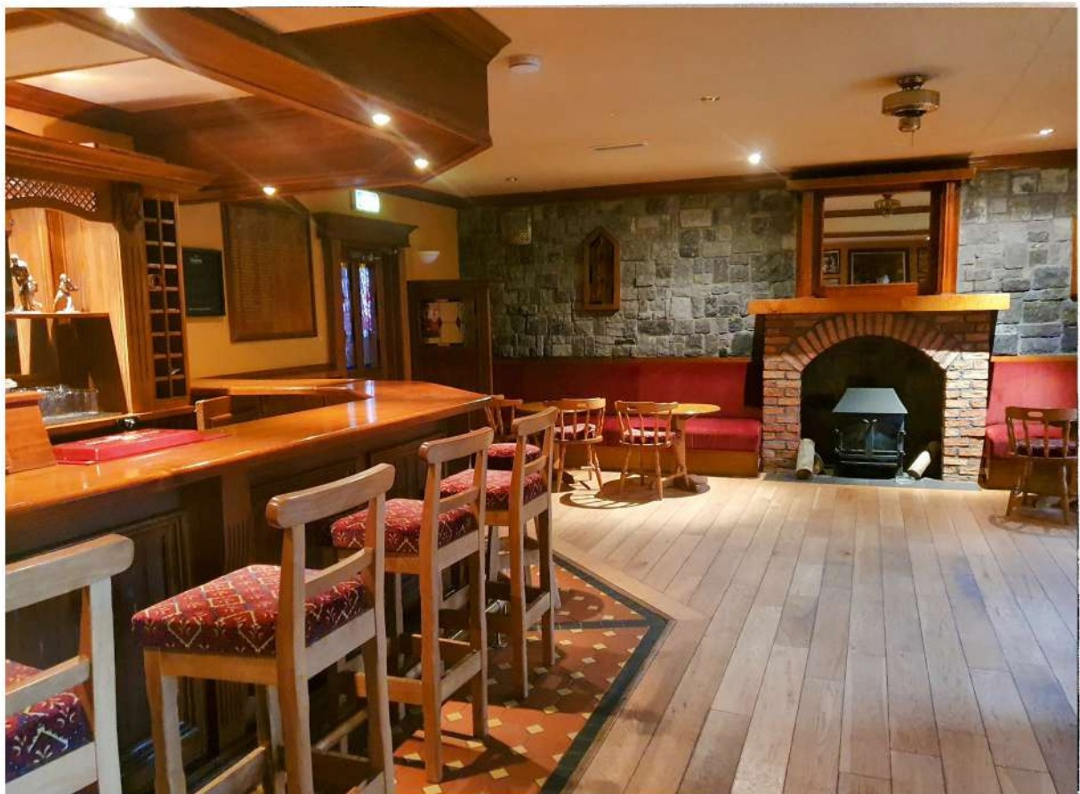
View of Public Bar with feature fireplace.