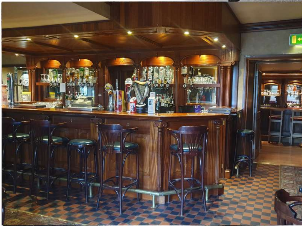
View of Public Bar Counter area.